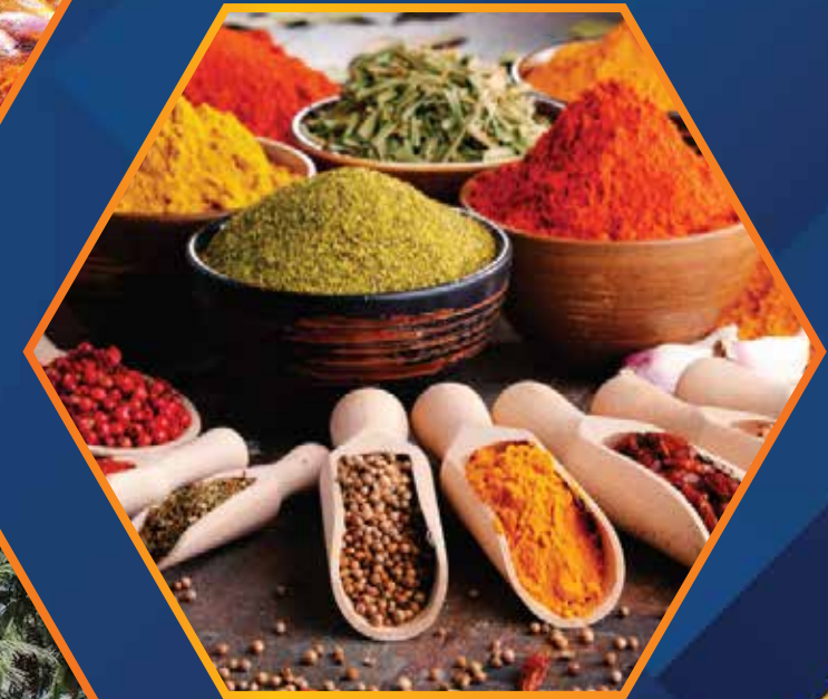
FOOD & SPICES PROCESSING PLANT