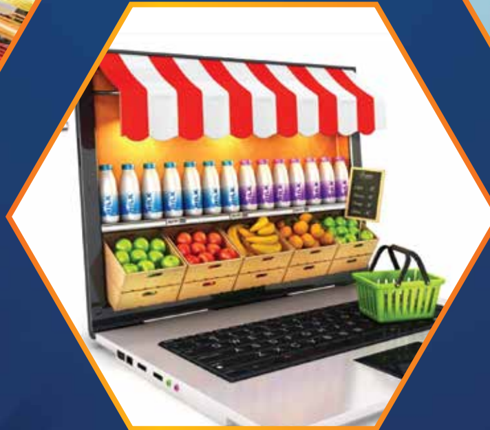
ONLINE GROCERY SHOPPING & SUPERMARKET ( IN INDIA )