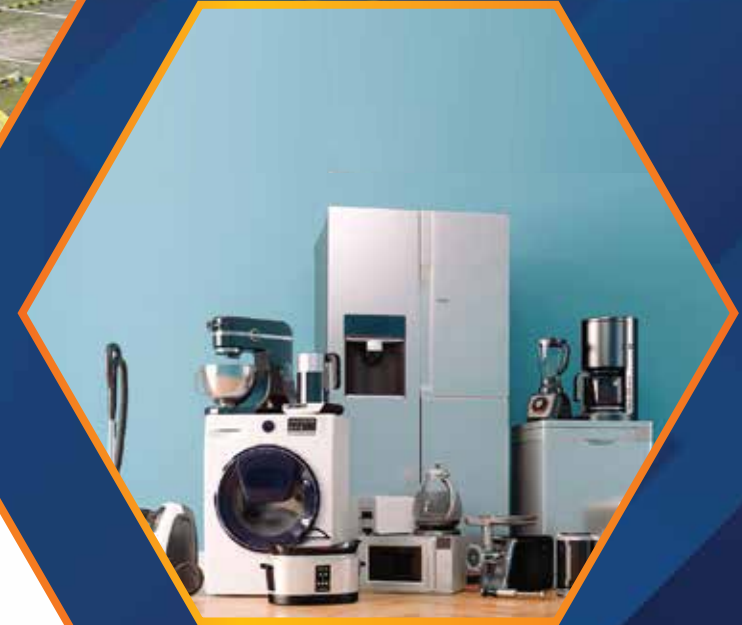
ONLINE HOME APPLIANCES