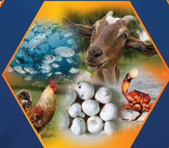
EXPORT OF PROCESSED LIVE STOCKS